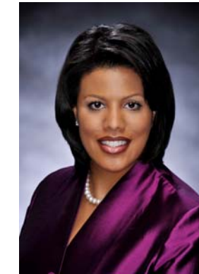
Mayor Stephanie Rawlings-Blake